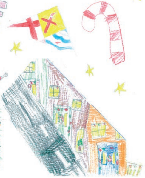
With special thanks to the students in Year 4 at Kingsfleet Primary School for their designs for the Mayor's Christmas card