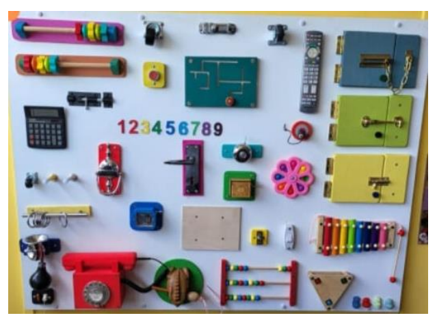
Sensory Board for Level Two projects

Wood turning has proved a very popular addition to the shed's activities and it is with great appreciation to Felixstowe Town Council as well as Councilor Bird that we have been able to purchase a professional wood turning lathe. This lathe will enhance both capability and capacity of what members can produce.