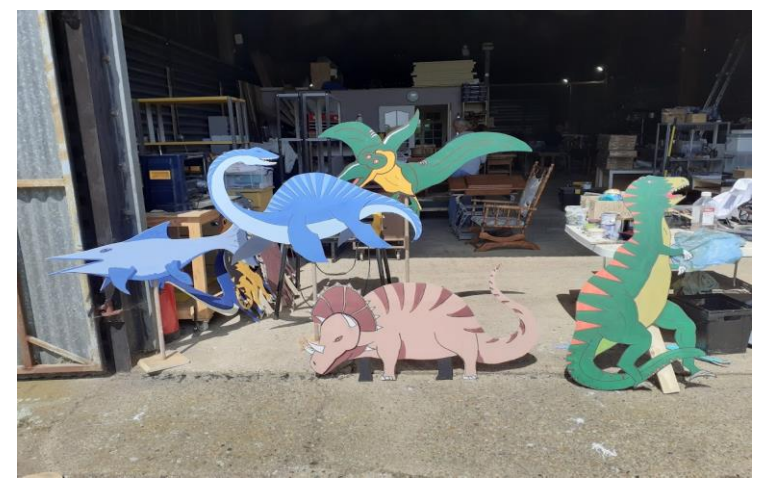
Dinosaurs for the trail at Landguard Fort