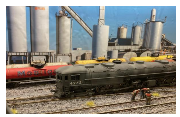
Restoration of Orwell High Part of a model railroad diorama

A mud kitchen for SET Felixstowe primary school