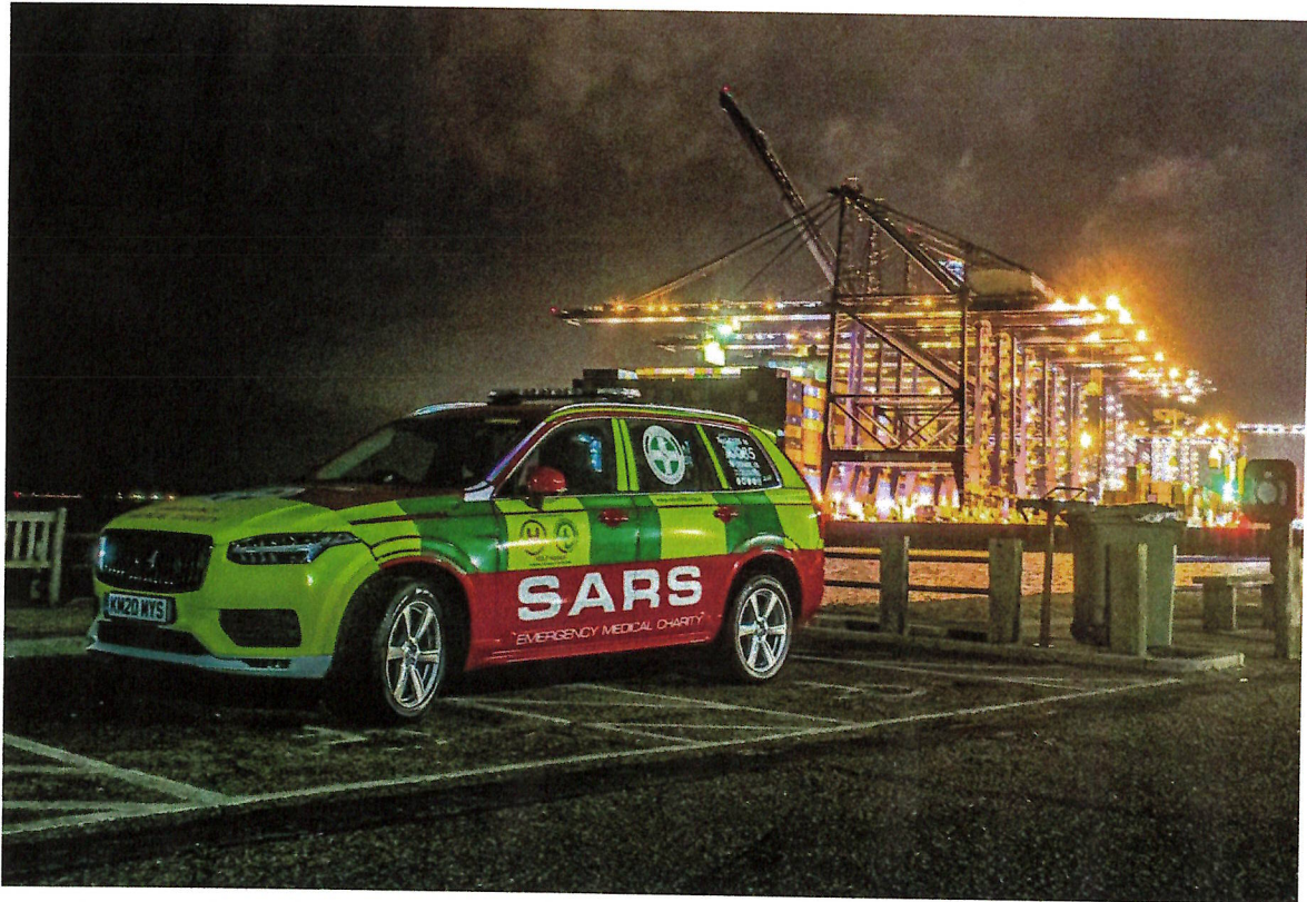
SARS team vehicle SMED26 at Felixstowe docks. SMED26 is based in East Suffolk and helps cover the Felixstowe area.

SARS is a Suffolk-based emergency medical charity that provides specialist volunteer clinicians to help treat critically ill or injured patients who require immediate or advanced medical care before they reach hospital. We aim to offer a local resource which can help those very sick patients who can really benefit from the additional skills, experience and specialist equipment of a SARS responder. Our volunteers include anaesthetists, consultants in emergency medicine and critical care paramedics. SARS clinicians can undertake complex procedures including surgical skills and advanced airway management which would not normally be possible outside the hospital environment.