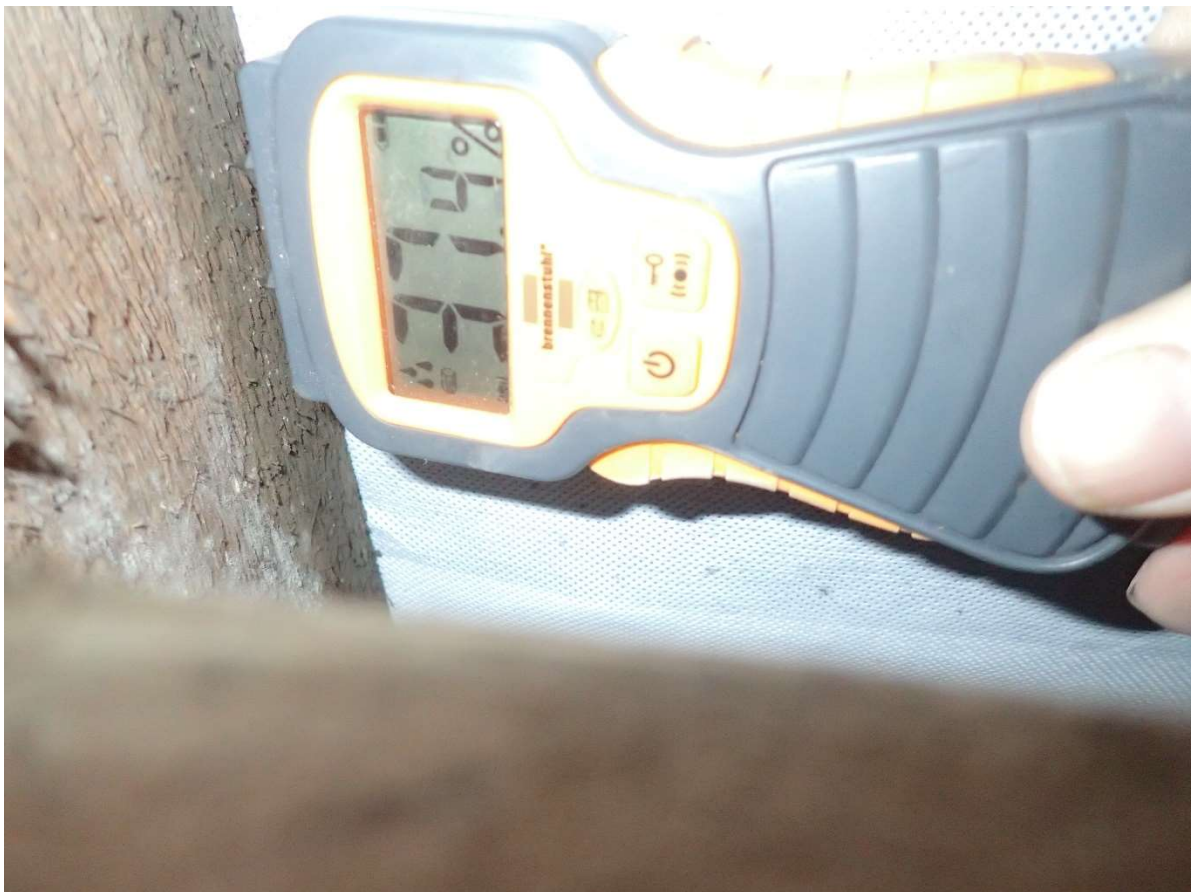
TYPICAL READING IN UPPER HALF OF RAFTER.