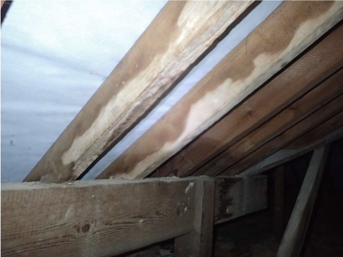
DAMP RAFTERS AS DESCRIBED IN 3.5