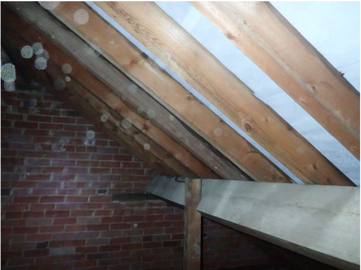
N.E. AREA, LOCAL HIGH MOISTURE CONTENTS.