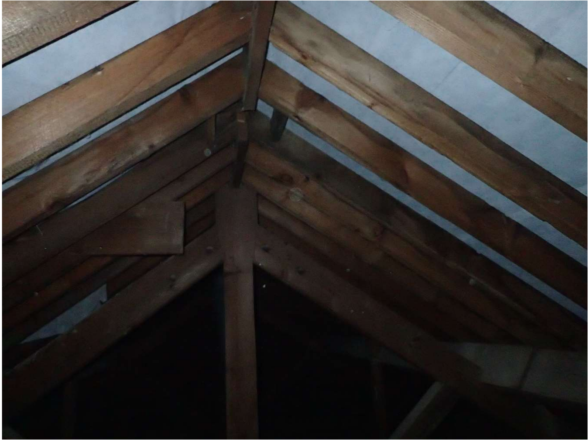
RAFTERS OVER COUNCIL CHAMBER AREA DESCRIBED IN 3.3